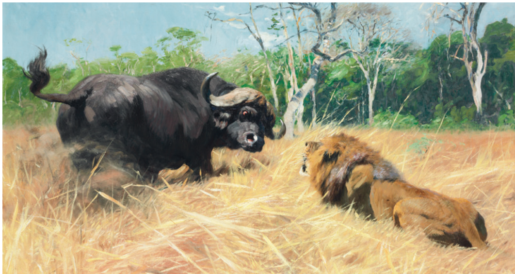
Buffalo and Lion Before the Fight, (oil on canvas)/Kuhnert, Wilhelm (1865–1926)

↑ As “king of the jungle,” the lion is often considered the greatest hunter in the world.